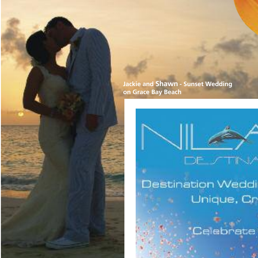
Jackie and Shawn - Sunset Wedding on Grace Bay Beach